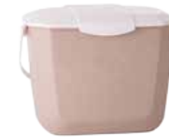
Kitchen Scrap Pail $12.00