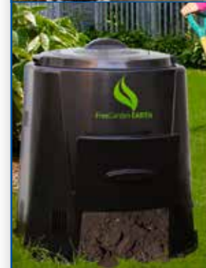
FreeGarden™ EARTH Compost Bin $60