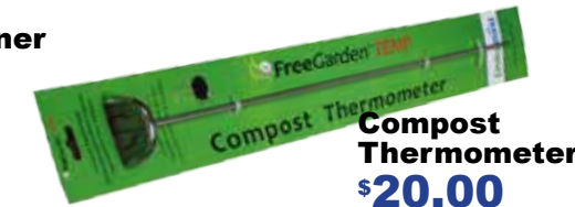
Compost Thermometer $20.00