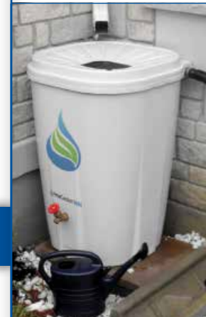
FreeGarden RAIN® 55 Gallon Rain Barrel $70