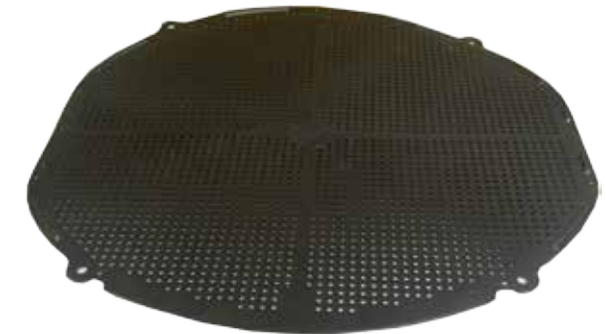
Compost Bin Mesh Bottom $15.00